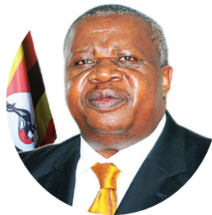
Rtd. Major Gen. Kahinda Otafiire Minister of Internal Affairs

Congratulations our dear Commander in Chief!