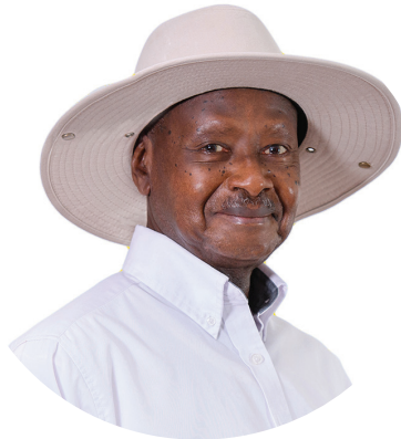
H.E Yoweri Tibuhabwe Kaguta Museveni President of the Republic of Uganda