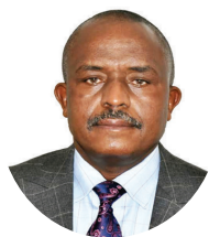
Lt Gen. Joseph Musanyufu (Permanent Secretary, Ministry of Internal Affairs)