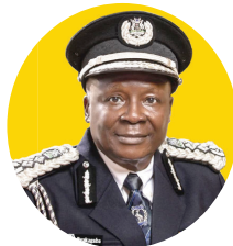
Abbas Byakagaba Inspector General of Police

Over the past four decades, under NRM leadership, Uganda has made significant strides in securing the nation and enhancing the well-being of its citizens. The Uganda Police Force has been privileged to contribute to these achievements through initiatives such as the sub-county policing model, expanded highway patrols, recovery of stolen livestock and illegal firearms, enhanced traffic enforcement, and emergency response services. In the last five years alone, UPF extended community policing to over 83% of villages, engaged over 6.5 million citizens in awareness campaigns, and strengthened capacity to respond to emergencies and protect public and private property.