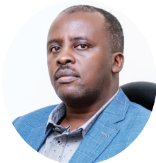
Gen. David Rubakuba Muhozi Minister of State for Internal Affairs