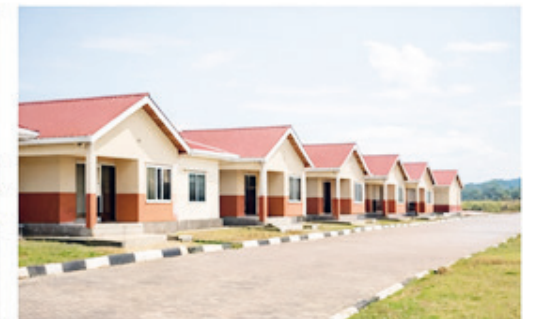
One of the residential housing units constructed across the Country